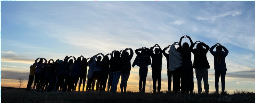
6A Welcoming the sunrise and whatever brings them Peace and Contentment on the Winter Solstice, December 21, 2023. Happy New Year!